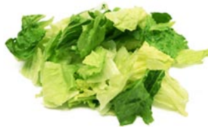
Romaine Lettuce Chopped