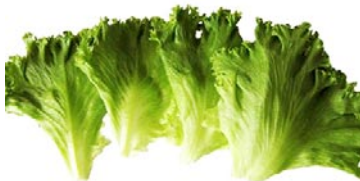
Better Burger Leaf