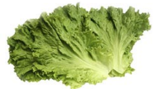
Green Leaf Fillets