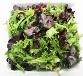
Heritage Tuscan Blend