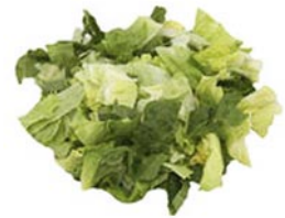
Iceberg/Romaine Blend 50/50