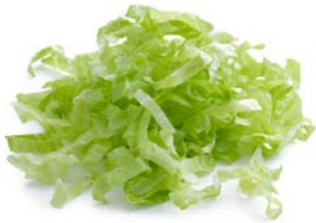
Iceberg Lettuce Shredded